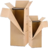
Trunks for clothes