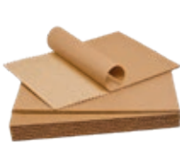
Sheets of corrugated cardboard

Choose from a wide range of types of packaging able to satisfy, in a short time, small and large production needs.