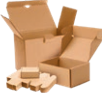
Die cut packaging